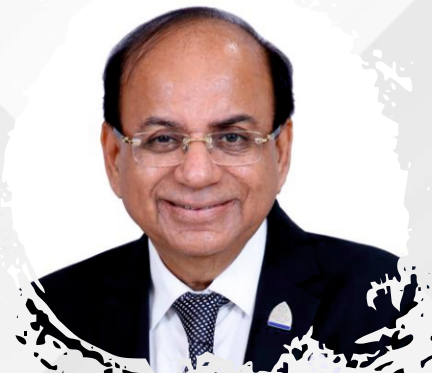
Ashok Kantoor Distt. Governor