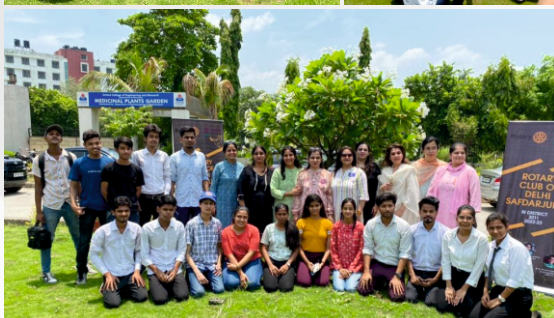
Rotary Club of Delhi Safdarjung Tree Plantation done today at United College of Engineering, Greater Noida of 300 Medicinal and Fruit bearing Trees done by Students of B. Pharm. and BA(JMC) Faculty and our Club Members on 08/07/2022